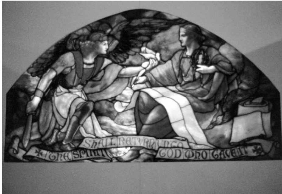
Hyde Memorial window, Recording Angel, 1899, fabricated by Tiffany Glass and Decorating Company, St. Mark's Episcopal Church, Islip, Long Island