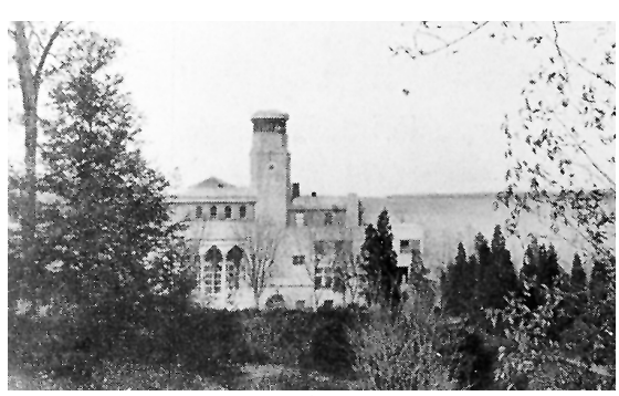
main residence, 1907