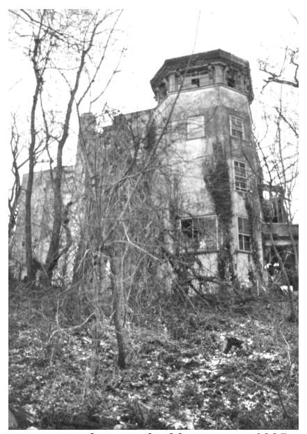
remnants of service building tower, 1997