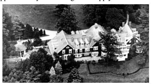
Elmhurst, c. 1920