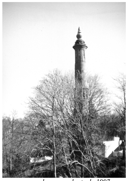
power house smokestack, 1997