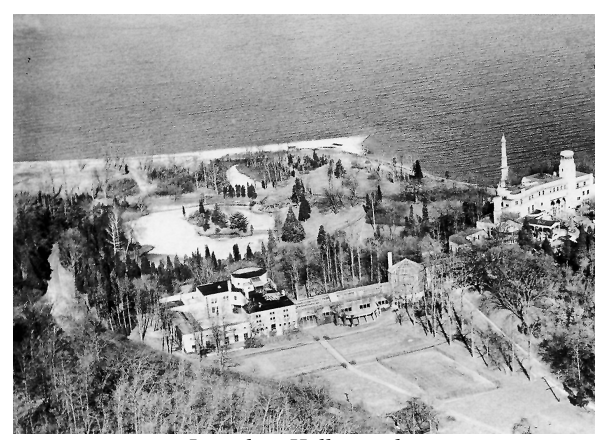
Laurelton Hall, aerial – main house and powerhouse smokestack, upper right; service buildings, lower left