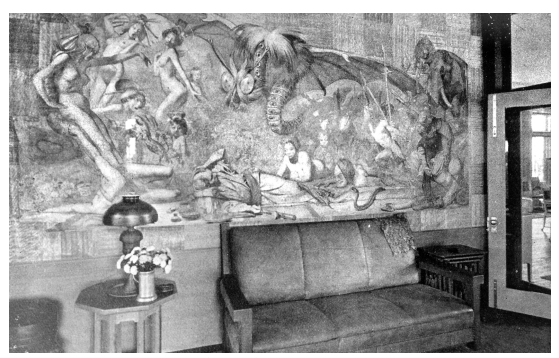
smoking lounge, c. 1907