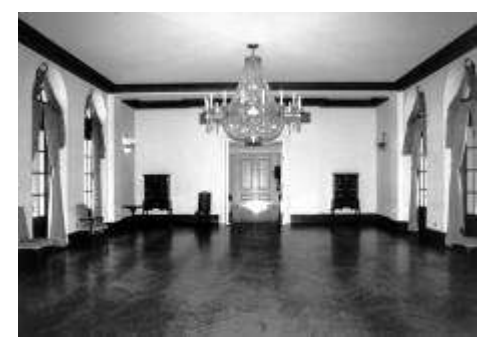
living room, 1990