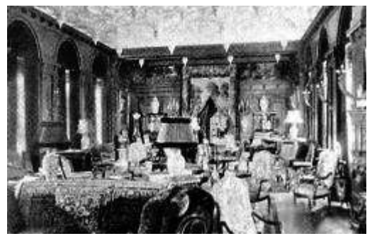
living room, c. 1903

William Kissam Vanderbilt Sr. Estate, Idlehour [1900]