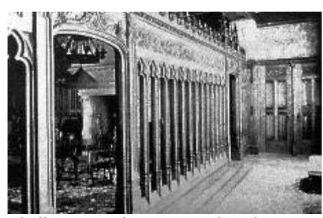
hallway outside men's smoking lounge, c. 1903