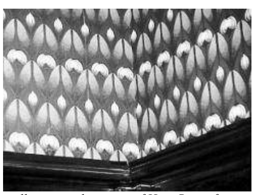
wallpaper replacement of Hunt Room friezes, 1990