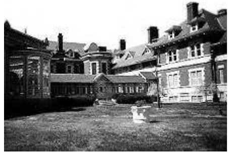
Idlehour, 1900 house, 1990

Landscape architect(s): House extant: yes Historical notes: