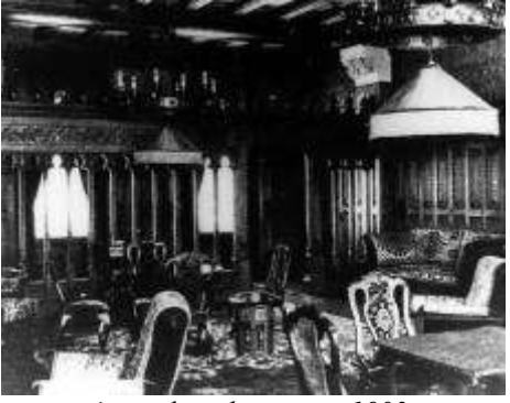
men's smoking lounge, c. 1903