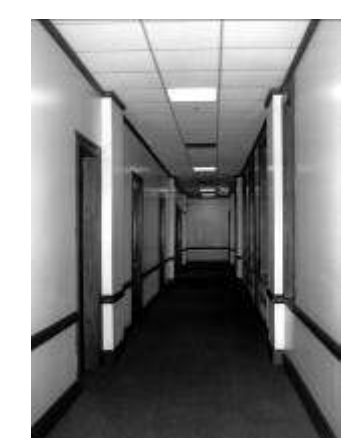
hallway outside men's smoking lounge, 1990