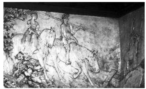
section of friezes in Hunt Room (dining room)