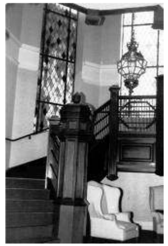
main staircase, 1990